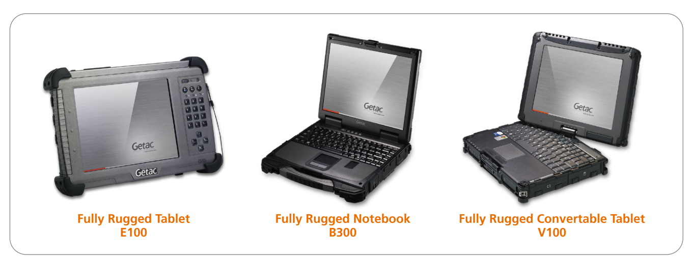
[Figure 3] Sunlight Readable Mil-STD-3009 Compliant Notebooks & Tablet PC

These products are equipped with Getac's patented Spectrum Adjustment Technology (SAT), which is built into the display's proprietary LED backlight module. Once the night vision mode is trigged, both red and infrared light will be properly adjusted to prevent images from appearing over-saturated dueing 650nm output by the MCP in third-generation night vision goggles. Figures 4.1 and 4.2 illustrate the difference between the spectrum of a standard light source and the spectrum of night vision light source.