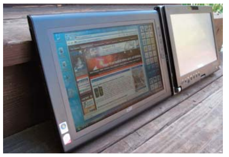
The picture below shows the toughest test of them all, with the displays facing directly into the sun. The picture was taken so that the sun did not reflect directly into the camera. Under these condi-

The same setting, but from an angle. The antiglare very effectively eliminates mirror reflections, but it also makes the display milky and unreadable. The Motion display is virtually unaffected.